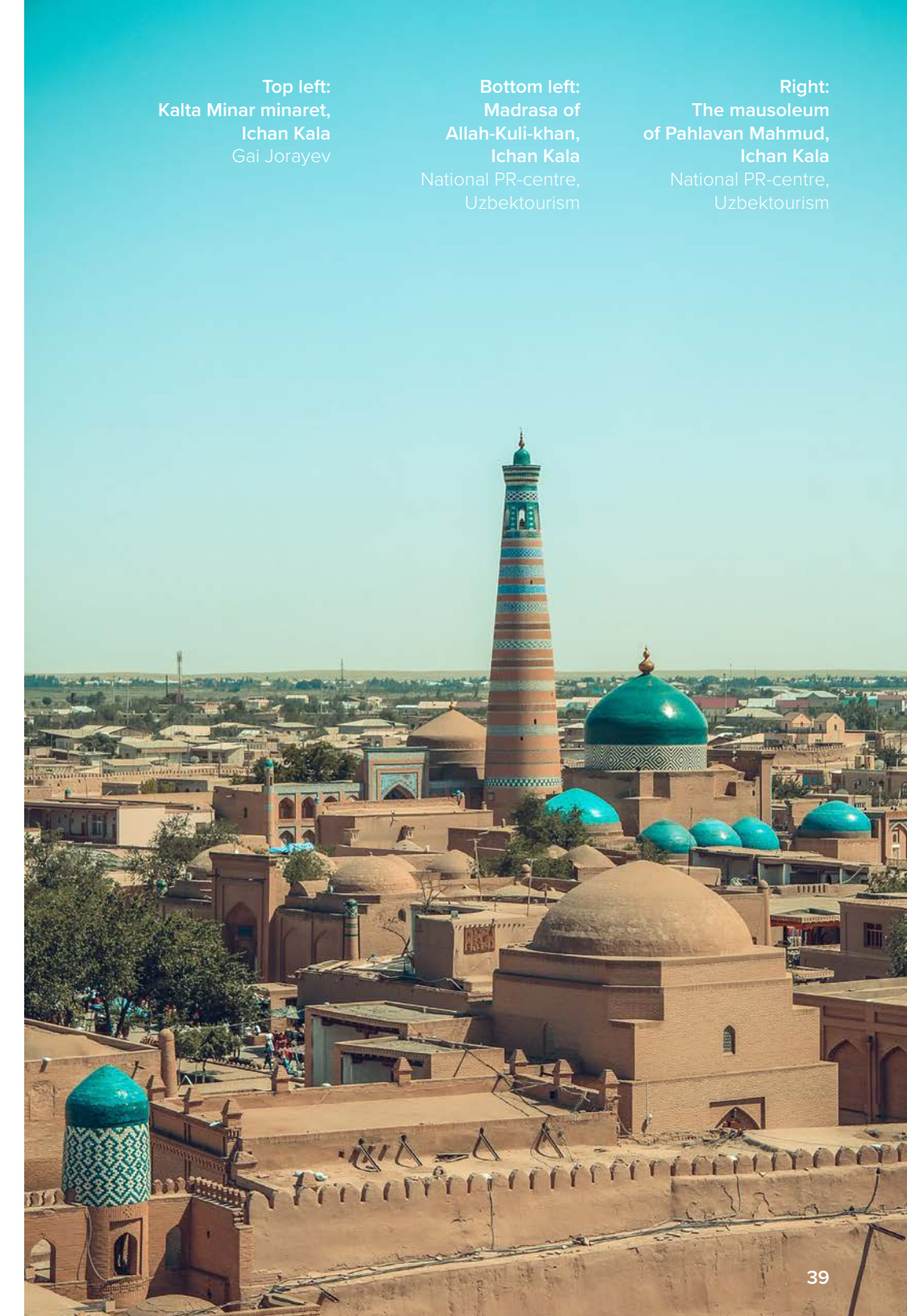
Right: The mausoleum of Pahlavan Mahmud, Ichan Kala National PR-centre, Uzbektourism