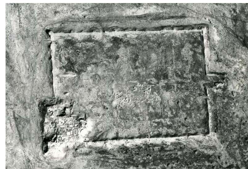
Right: Aerial photograph of Toprak Kala, 1969 Khorezmian Archaeological - Ethnographic Expedition British Library, EAP1075 project

The group organisation of Central Asian cities was not just limited to ancient times. There are legends from Islamic times of ritual yearly fighting between citizens divided into two groups; in Merv and Samarkand - the residents of the “medina” and the “old bazaar”, in Gorgan - the “shahristan” (central city) and the Bekrabad suburbs, separated by the river. This helped to reaffirm group allegiances within the city, but also strengthened both groups’ ties to their urban identity - without the city, neither existed.