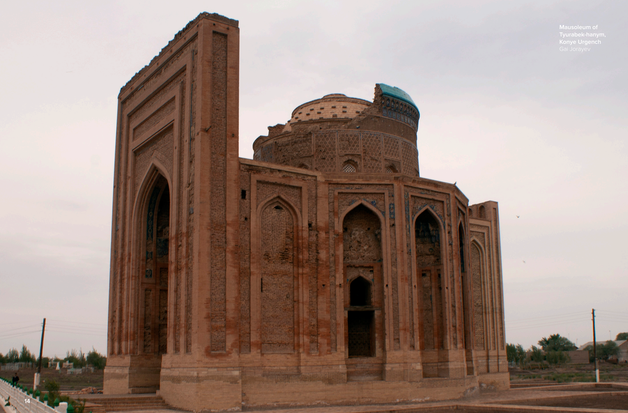
Mausoleum of Tyurabek-hanym, Konye Urgench