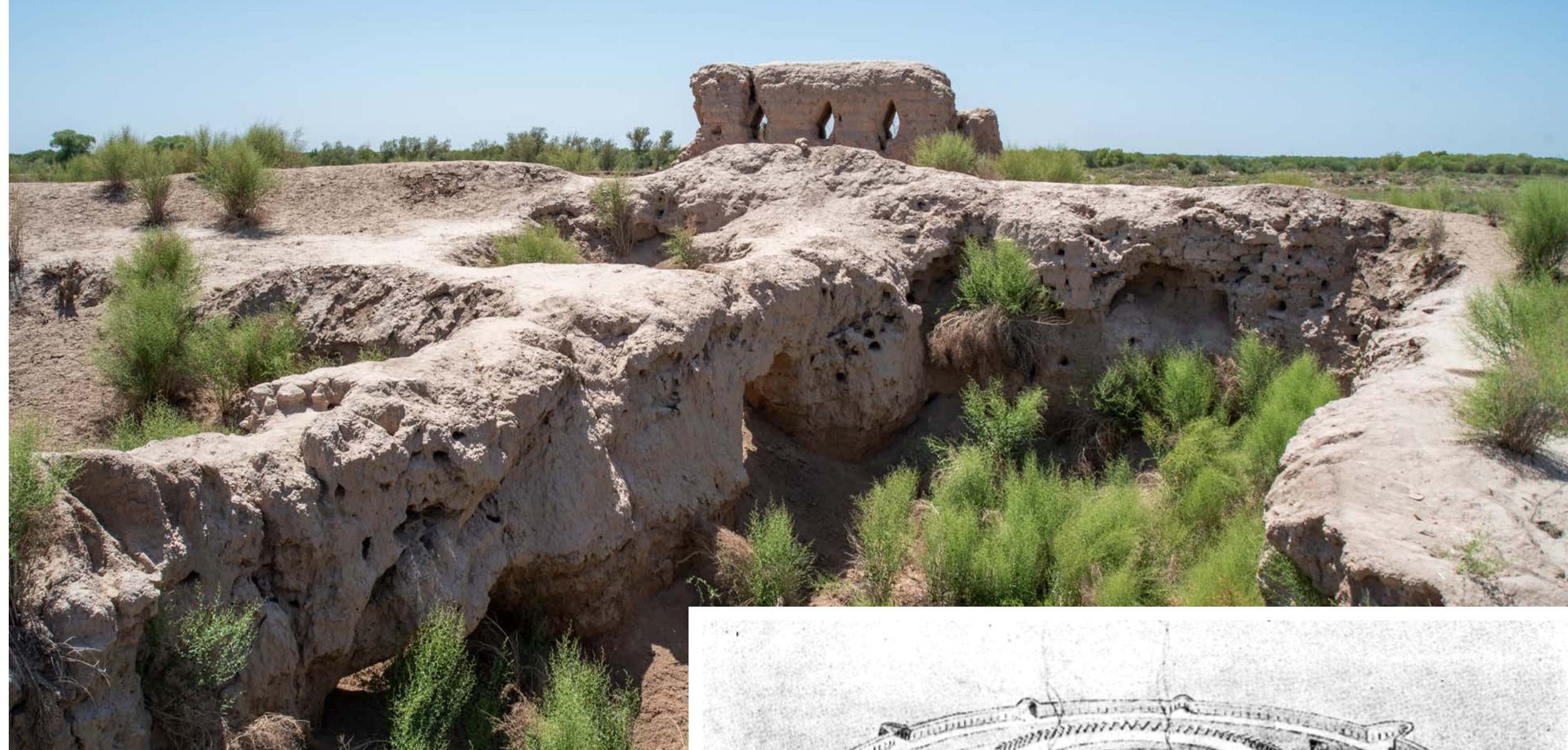
Above: Koi Krylgan Kala Azamat Matkarimov

drinking. On the eastern side, chambers were used for storage of temple utensils and performing funerary rites, while on the western side were burial chambers. Archaeologists have found some of the earliest ossuaries (clay burial vessels) and Khorezmian inscriptions here, as well as statuettes of gods and goddesses, and a huge amount of decorated pottery, both local and imported. The shape and placement of the tower has led to suggestions that priests used the tower as an astronomical observatory – astrology and the zodiac were frequently referenced in Zoroastrianism to predict and date events.