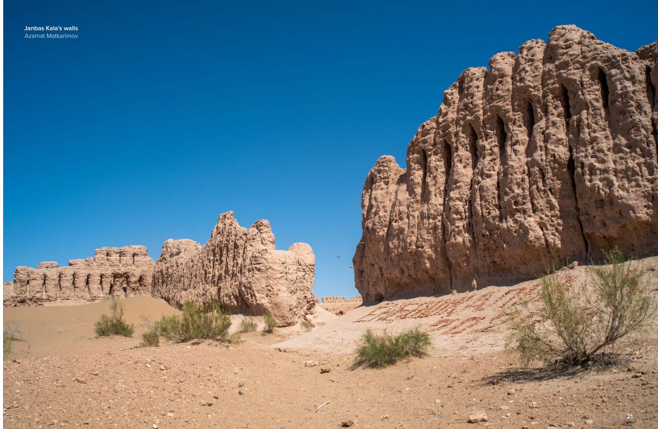
Janbas Kala's walls Azamat Matkarimov

The main street divided the city into two large residential blocks, each containing over 150 similarly sized rooms, all inter-connected without alleyways. The walls of the blocks used bricks with tamgas (family emblems). The tamgas found in one block were completely different from those in the other one, suggesting the fortress was divided into two main family or tribe-groups, each living in their own block. Rather than being organised hierarchically through class as most cities are, this city was organised by kinship, creating an indigenous Central Asian urban tradition.