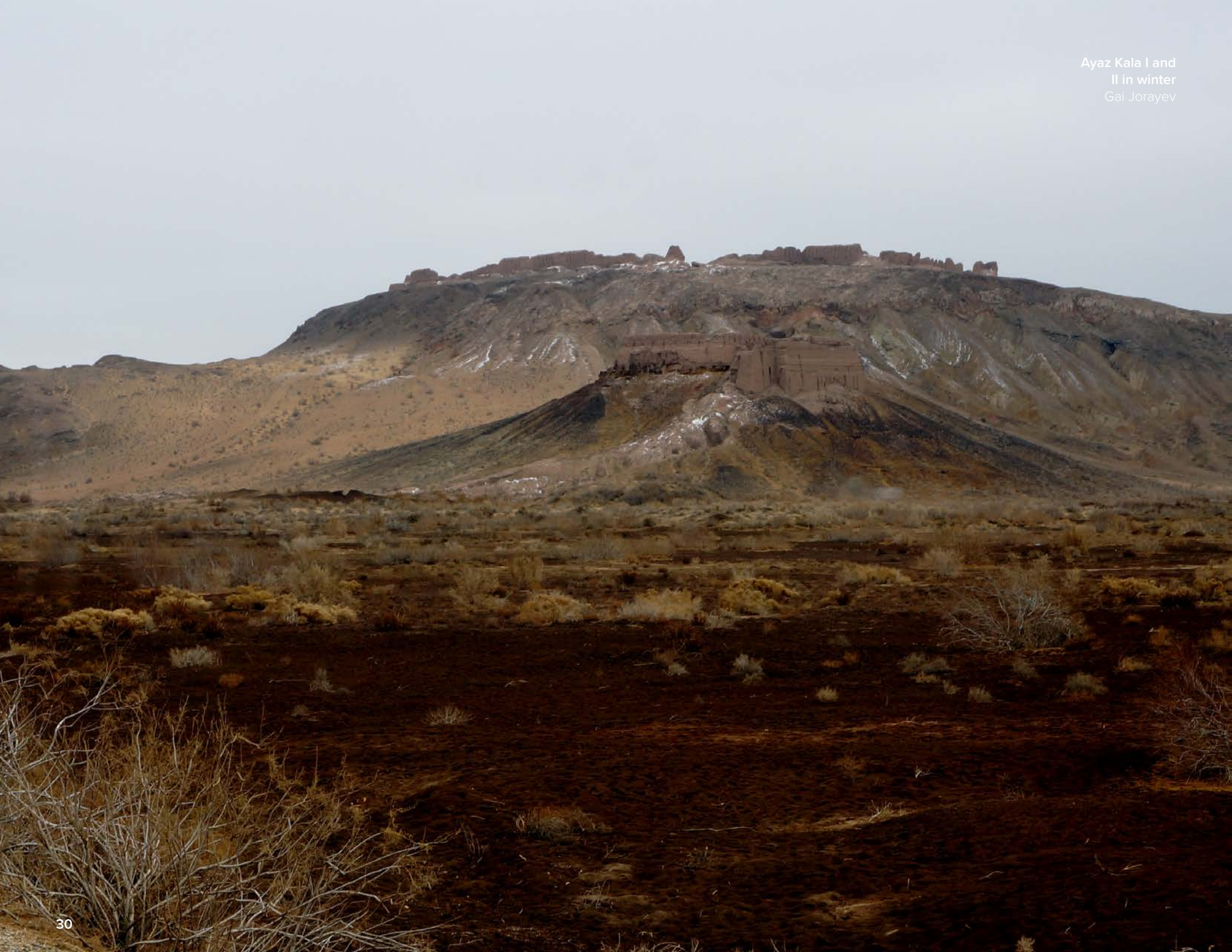
Ayaz Kala I and II in winter