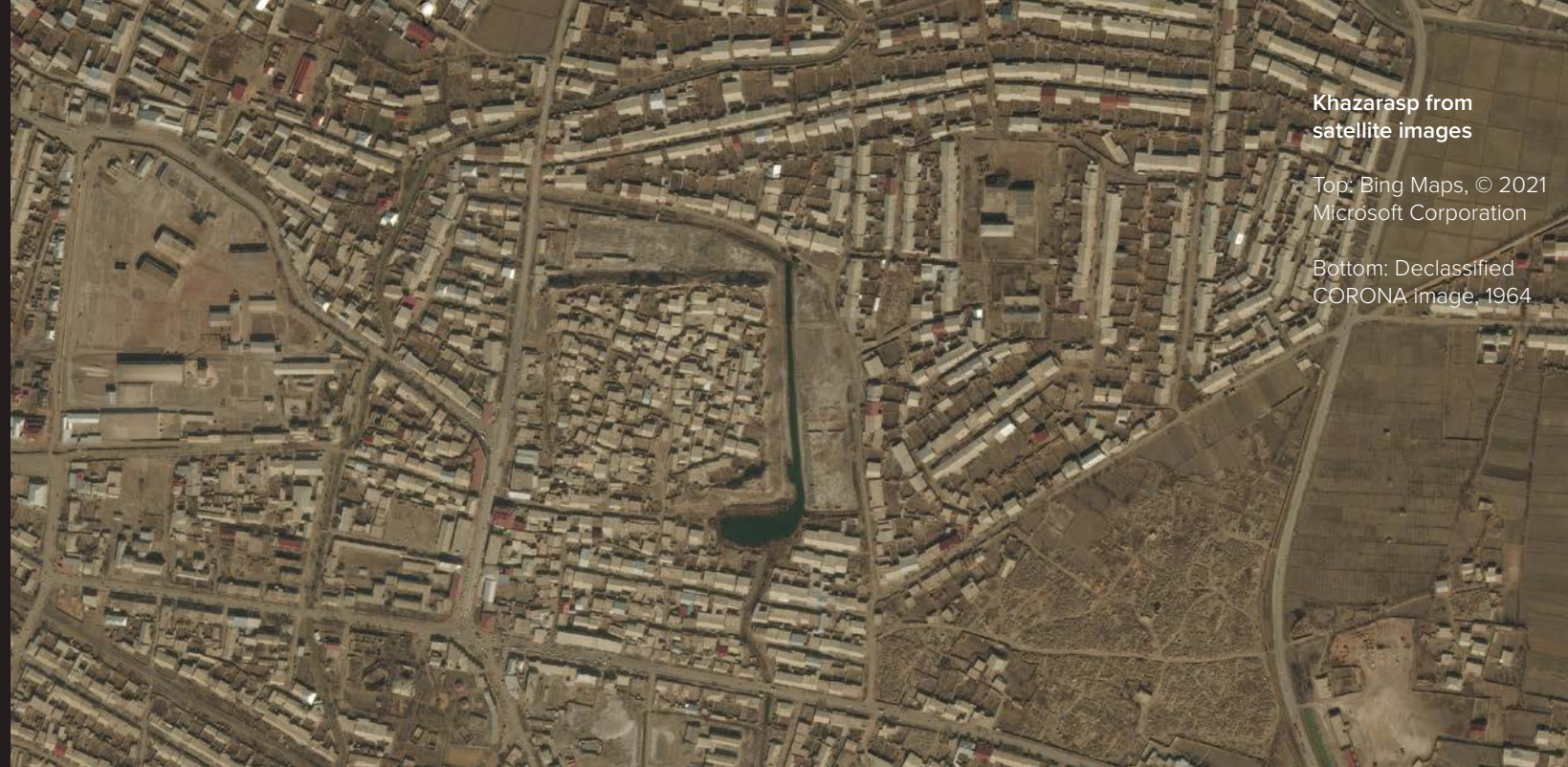
Khazarasp from satellite images

Despite the limited area of the Khorezm oasis, human activity has flourished for centuries, often damaging previous landscapes. With modern intensive agriculture and increasing populations, change has become particularly destructive. The comparison on the right shows the effects of 60 years of urban expansion at the ancient city Khazarasp, now engulfed by buildings. To minimise the damaging impact of human activities on heritage, the CAAL project, including local stakeholders, is developing an open access database monitoring the condition of Central Asian cultural sites and the risks facing them.