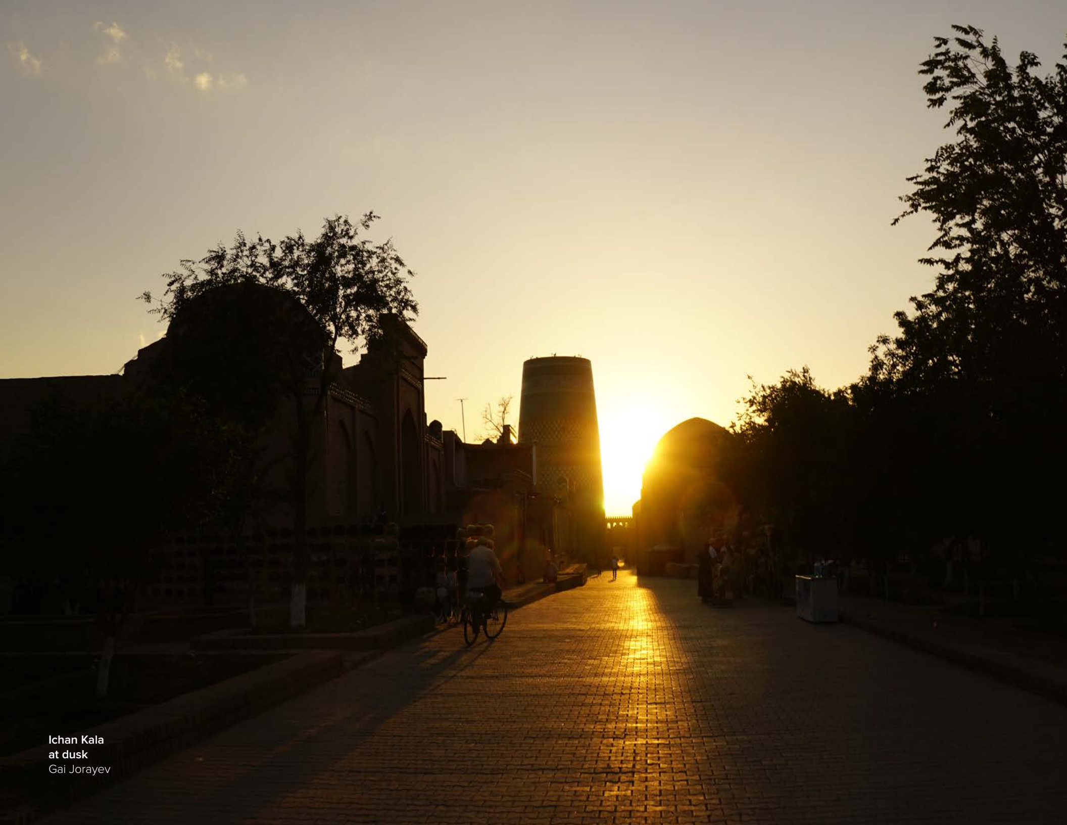
Ichan Kala at dusk