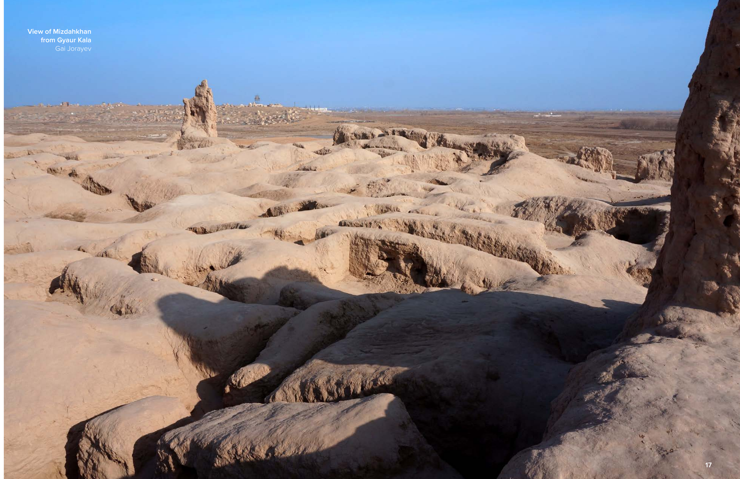
View of Mizdahkhan from Gyaur Kala

with a hall of washing and prayer. According to legend, she was incredibly beautiful and fell in love with a simple builder. The khan agreed to give his daughter to the builder if he built a minaret as tall as the sky in one night. The builder completed this task, but the khan broke his promise, and so the builder threw himself from the tower, as did the princess. The khan ordered the minaret to be destroyed and buried the two together, building a mausoleum out of the minaret bricks. Another mausoleum is the seven-domed tomb of the giant-saint Shamun Nabi, still considered a sacred place. Shamun Nabi was a sorcerer, and locals say his tomb is surrounded by magic stones; if you put 7 stones in a pile and make a wish, your wish will come true. Mizdahkhan is still an active cemetery today, so if you visit it do not be surprised if there are people in prayer or finishing pilgrimages, and please be respectful that this is still a sacred place for many.