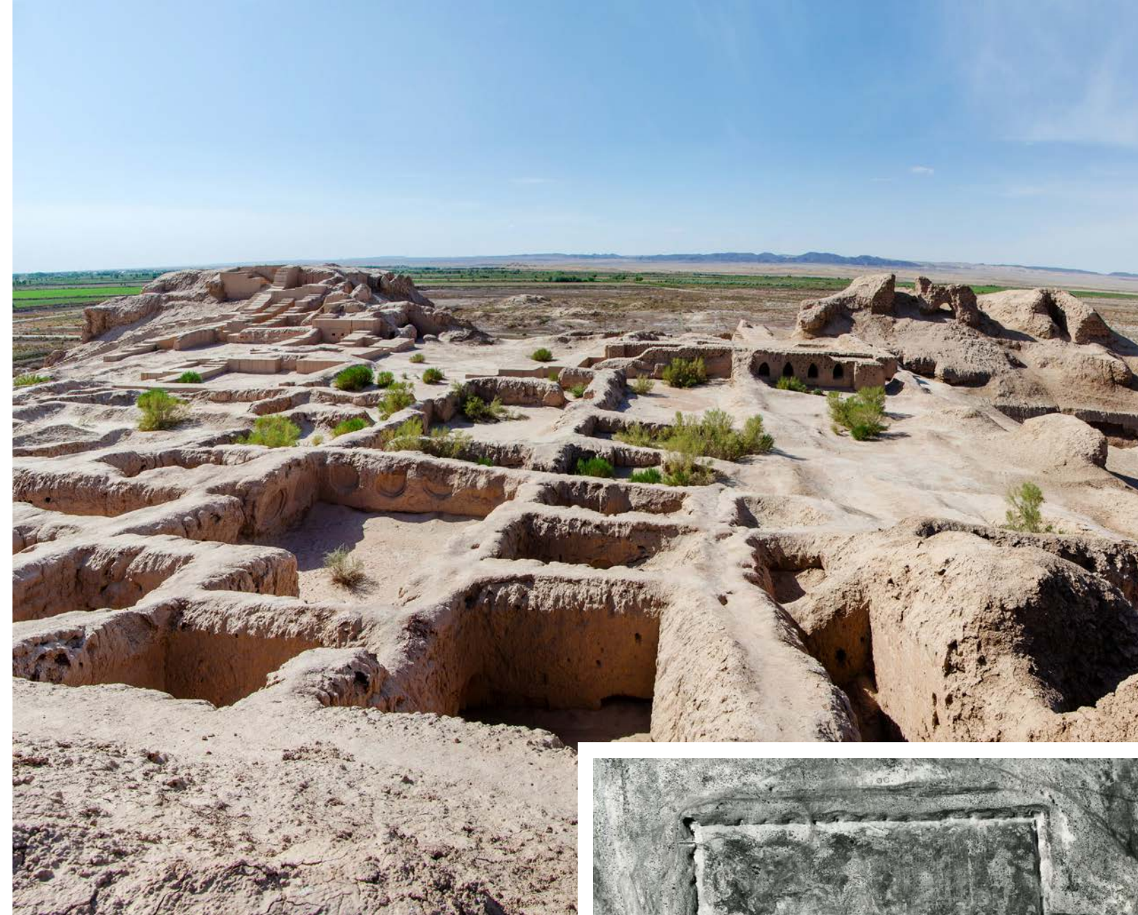
Above: Palace of Toprak Kala

As with Janbas Kala, Toprak Kala's residential area was divided into blocks of interlinked rooms; over 200 people could live in one such large-family home. Despite influences from other cultures, this was an original form of Central Asian urbanism that placed importance on kinship as the social glue of the city.